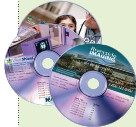
Create your own custom disk labels