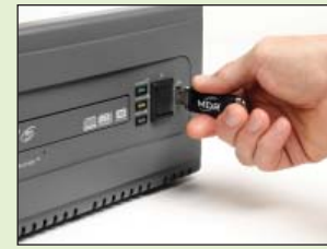
Record to USB media